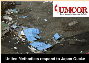
United Methodists respond to Japan Quake